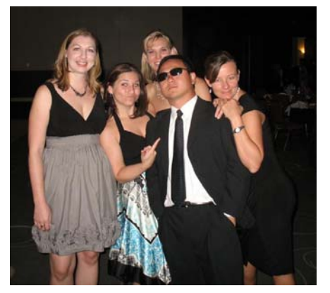
Students ham it up for a photo at the AANA annual banquet.