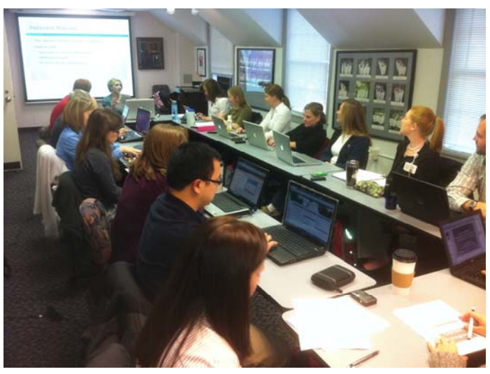
Our small class size allows for rich, interactive classroom activities.

Nurse Anesthesia Program Wake Forest Baptist Health Medical Center Boulevard Winston-Salem, NC 27157