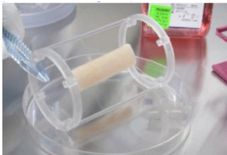
Bioprinted Organs: The Solution To Transplantation, Reports U.S. News