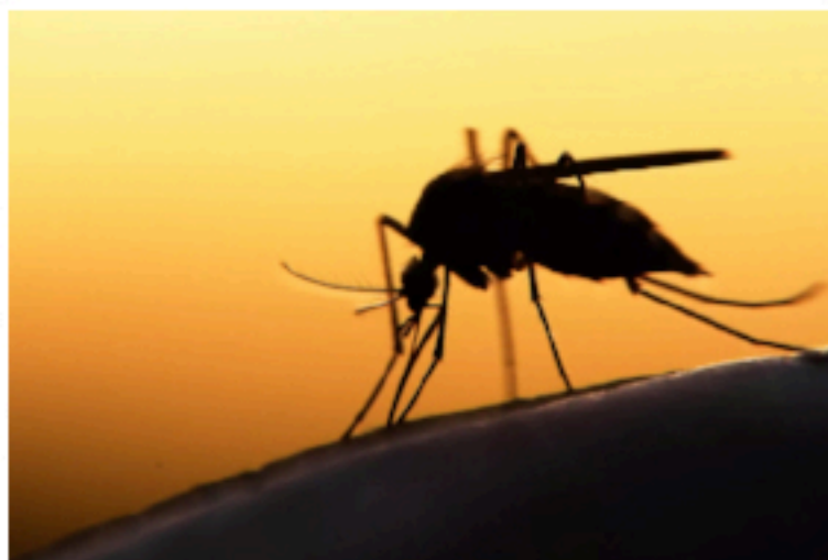
Organoid System To Test Male Infertility After Zika Featured By WS Journal